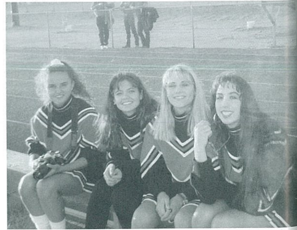
Long road trips to games as far away as Fort Hancock can be tiring and exasperating, but the cheerleading team had a great time.