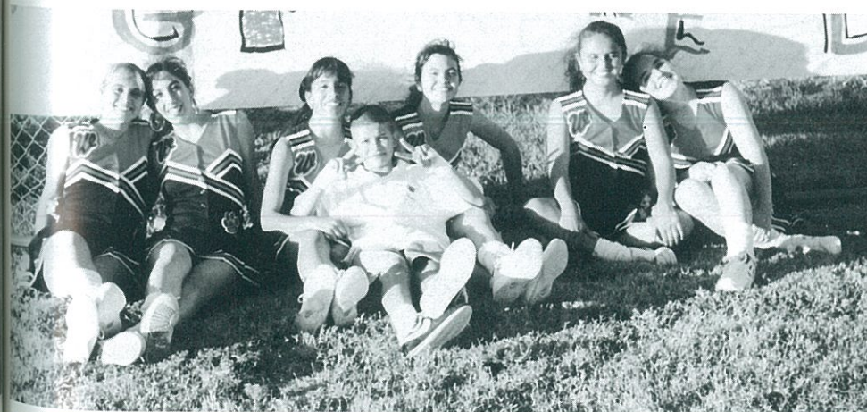
The varsity cheerleaders and mascot enjoy the beautiful weather prior to the kick-off of the season opener against the McCamey Badgers.